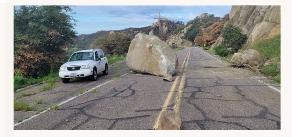
Photo caption: August 22, boulder on Hwy 386 near mile 10.5. Boulder size was reported to be 12'x8'. Without vegetation, many rocks and boulders washed down and into culverts. There were many rockslides reported during the monsoon season. In addition, the posts for the road guardrails burned along the top several miles of the road. Many electrical poles burned or were damaged, severing the line power and internet cables.

Spacewatch staff were allowed to begin clean-up operations in August, while on alert for emergency evacuation in case of a monsoon. After Kitt Peak National Observatory (KPNO) installed temporary extra generators and a Starlink dish, Spacewatch was able to restart operations on September 6, although operations were hampered by the unreliability of generators --- dome shutters are not opened unless there is some form of backup power. Line power was restored to the summit on October 7. With extremely limited bandwidth for the summit, Spacewatch was restricted to onsite observing and experienced frequent blips in connectivity. The internet fiber connection was restored on December 8, bringing Spacewatch back to full strength. However, the road is still closed to traffic, with only staff or experienced tenant drivers permitted to navigate the road without an escort vehicle.